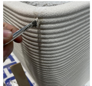
Brush on to Repair